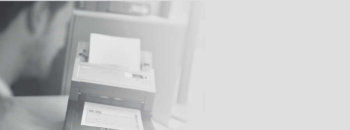
Image Processing features generate clearly legible articles for reading, reduce file size for sharing and prepare content for OCR (Optical Character Recognition) software. This means less time spent manually correcting and preparing documents, and more time spent focusing on the core needs of the business.