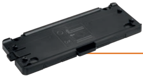
OUTPUT TRAY OT-1001C