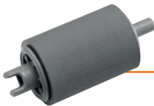
PICKUP ROLLER PUR-2001C