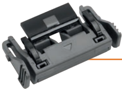
SEPARATION PAD SP-2001C