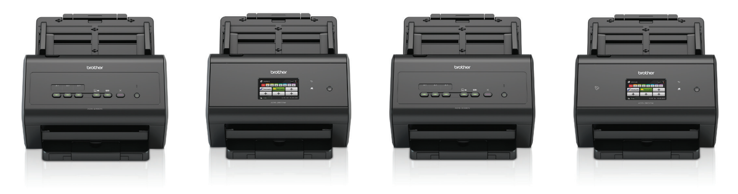
For PC, Mac, Linux and anybody with a stack of documents.