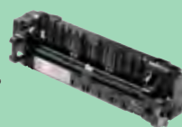
Fuser Unit FD-5000