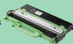
Waste Toner Box WT229CL