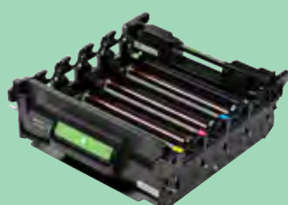
Drum Unit DR625CL