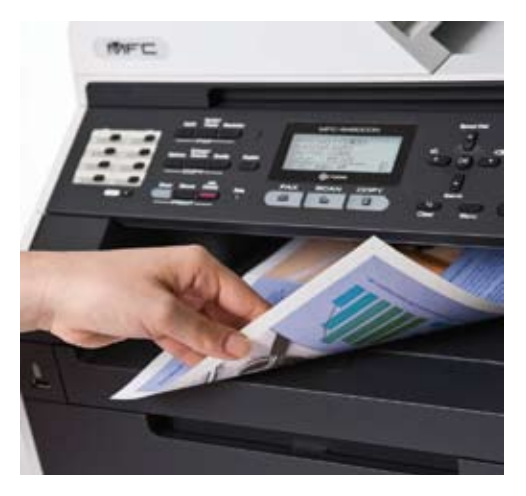
Automatic double sided printing for professional business documents

Equipped with more features to help you spend less on printing and improve office productivity.