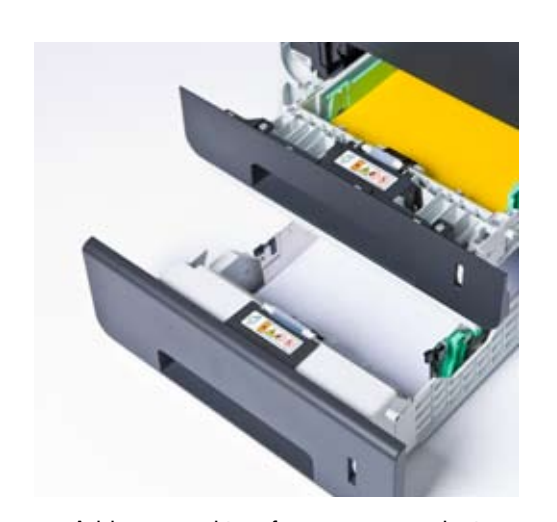
Add a second tray for more convenient paper handling.