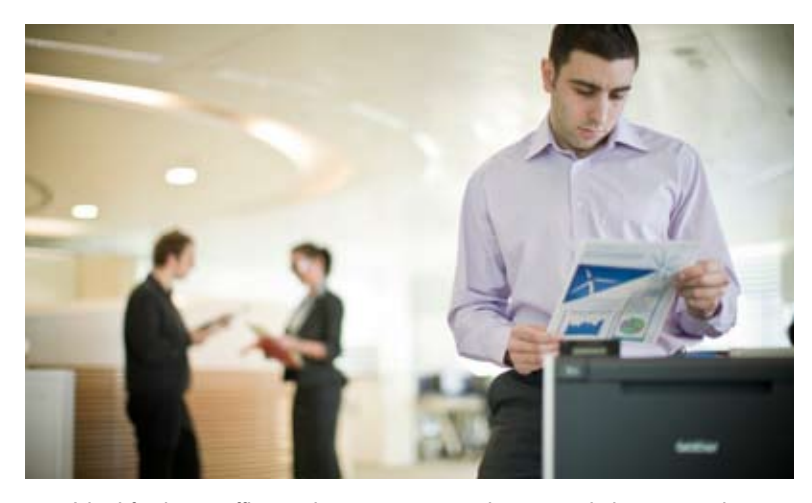
Ideal for busy offices: share resources via your existing network.