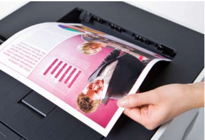
High resolution printing for professional quality.

SSL encryption. Although documents are sent from computer to printer within seconds, this is long enough for the information to be hacked. SSL prevents this by encrypting the data you send over the network.