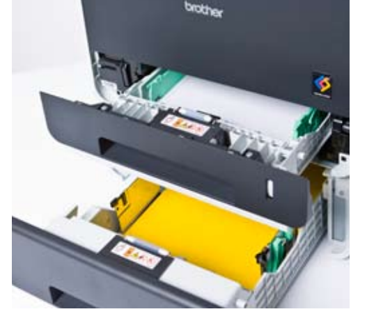
Optional lower tray for higher paper capacity and more flexibility.

With these innovative, simple to use solutions you can cut costs and save time while getting the job done.