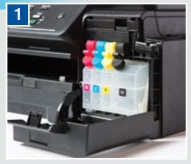
Open the ink cover to access the ink tanks.