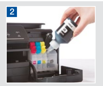
Remove the cap, tilt ink bottle at 45° angle and squeeze gently to refill.