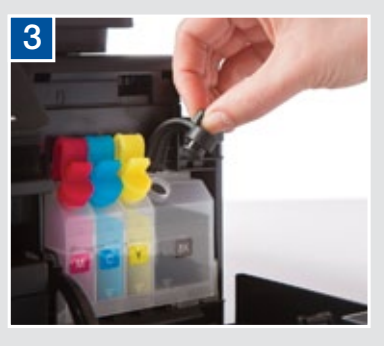
Close cap and ink cover and you're done!