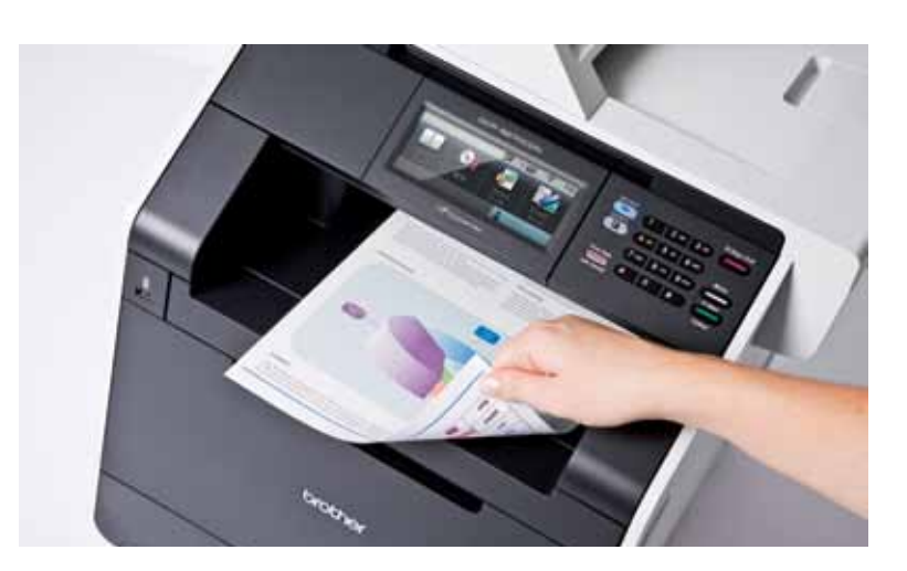
Automatic double sided-printing for professional business documents