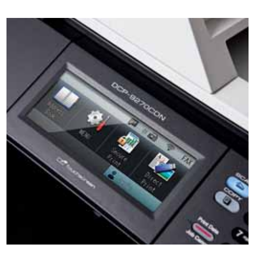
Easy to use control panel with 5.0" (12.6cm) Touchscreen LCD

Secure Socket Layer (SSL) Encryption. Although documents are sent from computer to printer within seconds, this is long enough for the information to be hacked. SSL prevents this by encrypting the data you send over the network, ensuring confidential reports remain secure.