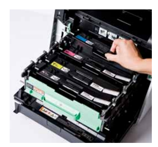
Reduce print costs further with the optional Super High Yield Toner cartridges

Packed with a wealth of time and cost saving features, the DCP-9270CDN will be a welcome addition to your office.