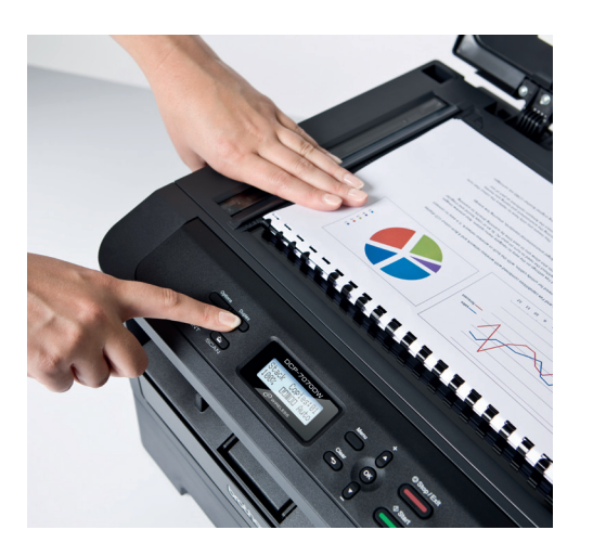
Scan colour documents direct to your PC