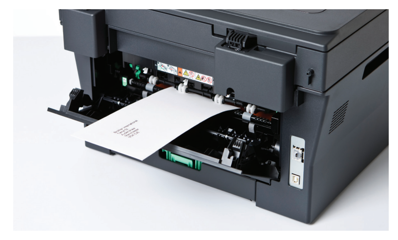
Print on thicker media and envelopes using the manual feed slot