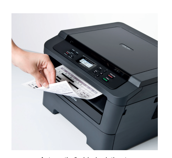
Automatic 2-sided printing to reduce print costs

The DCP-7070DW comes complete with a range of easy-to-use software utilities to improve your productivity. Bundled with the powerful Scansoft® Paperport™ document management software, hard copy documents such as invoices can be scanned in colour, stored and managed electronically for future retrieval.