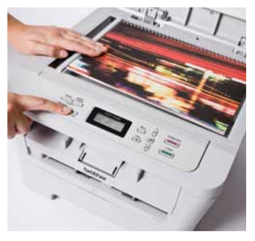
Scan colour documents direct to your PC