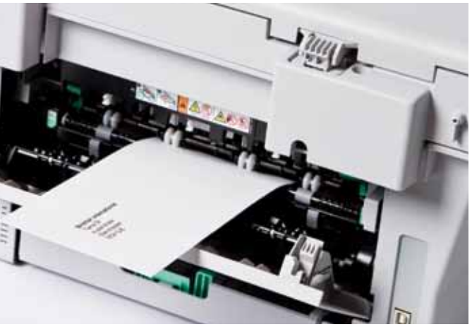
Print on thicker media and envelopes using the manual feed slot

The DCP-7055 comes complete with a range of easy-to-use software utilities to improve your productivity. Bundled with the powerful Scansoft<sup>®</sup> Paperport<sup>™</sup> document management software, hard copy documents such as invoices can be scanned in colour, stored and managed electronically for future retrieval.