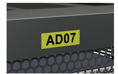
Strong adhesive tape