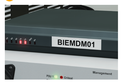
Strong adhesive tape