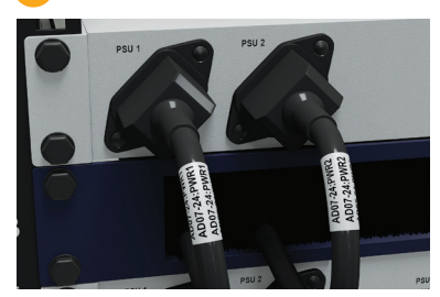
Flexible ID tape