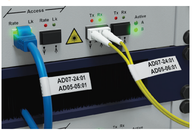
Flexible ID tape