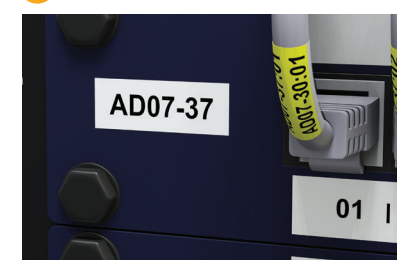
Strong adhesive tape