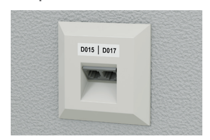
Strong adhesive tape