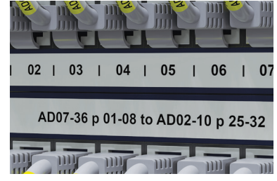
Strong adhesive tape