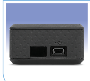
Direct thermal printing offers the most reliable technology for mobile printing solutions

Seamless connections with Bluetooth, Wi-Fi, USB and communications to other devices