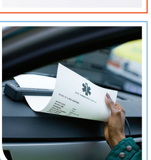
Durable , and dependable. The PJ-700 series has been designed for reliable printing in many environments

Choice of power options including Li-ion rechargeable battery, AC adapters or vehicle power kits