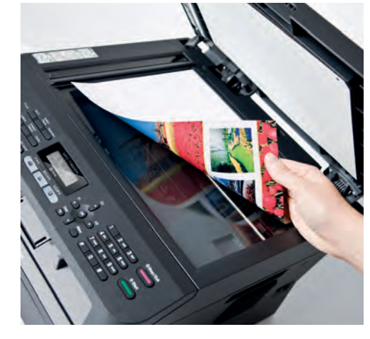
Scan colour documents direct to your PC