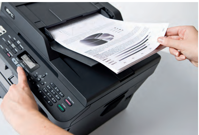
Scan, copy and fax multipage documents easily with the 35 sheet ADF

Thanks to its low power consumption, low noise levels and extremely low impact on the environment, the MFC-7460DN has been awarded both ENERGY STAR accreditation and the prestigious Blue Angel environmental label. Brother's separate toner and drum system significantly reduces waste. Moreover, you can return your empty toner cartridge to Brother to be recycled free of charge.