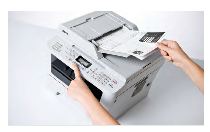
Scan, copy and fax multipage documents easily with the 35 sheet ADF