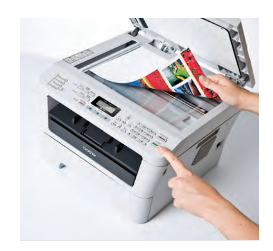
Scan colour documents direct to your PC