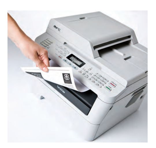
Fast and efficient printing at speeds of up to 24 ppm

The MFC-7360N comes complete with a range of easy-to-use software utilities to improve your productivity. Bundled with the powerful Scansoft® Paperport™ document management software, hard copy documents such as invoices can be scanned, stored and managed electronically for future retrieval.