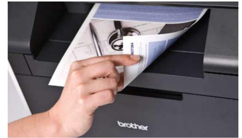
Automatic double sided printing for professional business documents