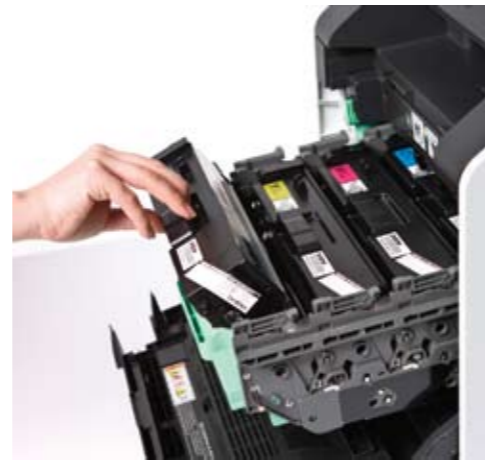
Reduce print costs further with the optional Super High Yield Toner cartridges

Be more productive in the office with the DCP-9055CDN's impressive range of cost and time saving features.