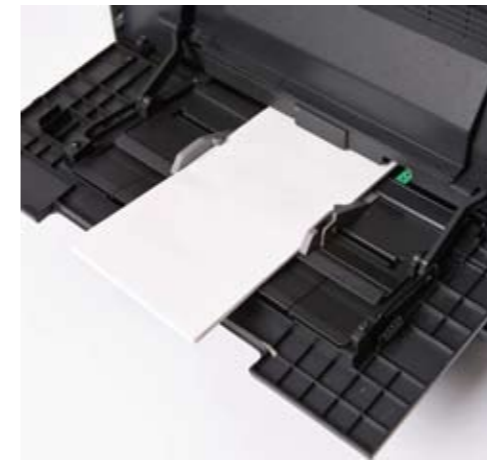
Print on envelopes and thicker media using the multi-purpose tray