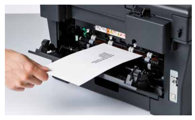
Print on thicker media and envelopes using the manual feed slot