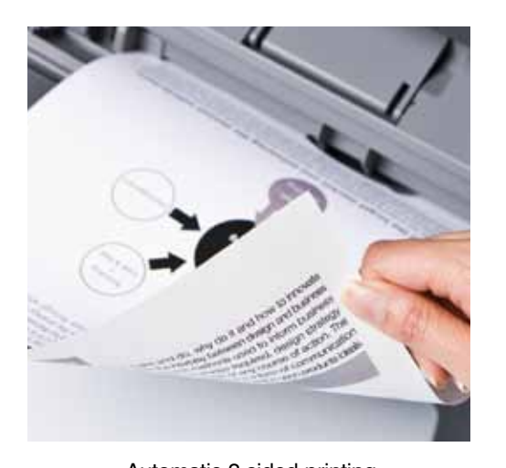
Automatic 2-sided printing to reduce print costs

The DCP-7060D comes complete with a range of easy-to-use software utilities to improve your productivity. Bundled with the powerful Scansoft® Paperport™ document management software, hard copy documents such as invoices can be scanned in colour, stored and managed electronically for future retrieval.