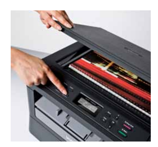
Scan colour documents direct to your PC