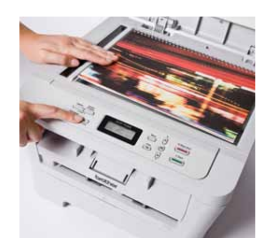
Scan colour documents direct to your PC