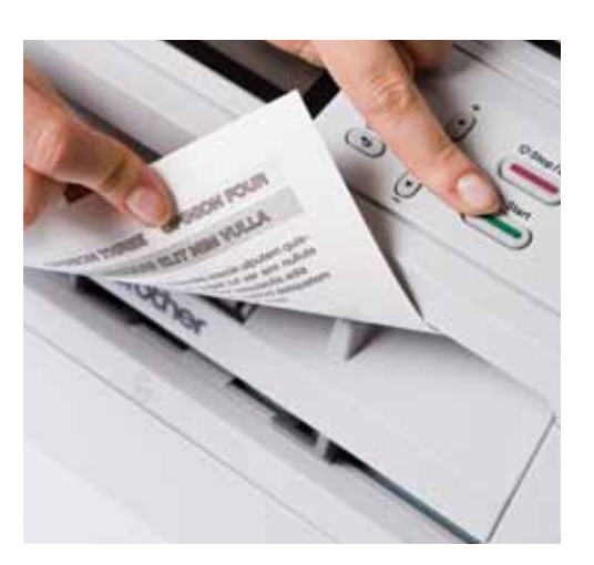
Fast and efficient printing and copying at speeds of up to 20 ppm