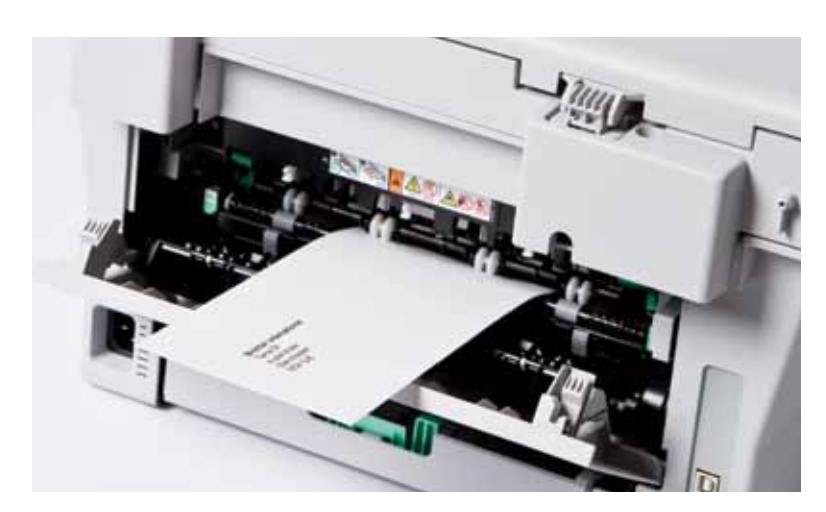
Print on thicker media and envelopes using the manual feed slot