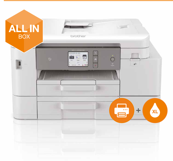
MFC-J4540DWXL is shipped with LC426XL Cartridges. The first time you install a set of ink cartridges the machine will use an amount of ink to fill the delivery tubes for high quality printouts. This process will only happen once. The amount of ink remaining*** will be a minimum of 5100 pages BK and 3750 pages CMY.