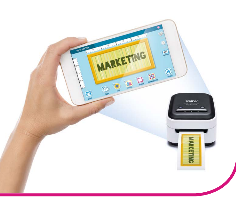
Color Label Editor