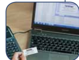
Prints labels from your PC or Mac