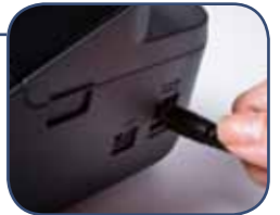
Uses 6 x AA batteries* or included AC adapter