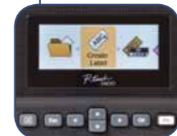
High-resolution colour display