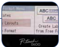
Built-in editable label designs