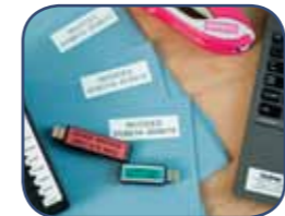
Print labels 3.5 – 24mm in width

Alternatively, connect to your PC or Mac and be creative by using various fonts, text styles, images and frames on your label design. You can even link to text contained in a Microsoft Excel spreadsheet to quickly print many labels at once, thanks to its high-speed print capabilities and fully automatic cutter.