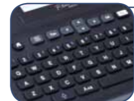
Easy-to-type PC-style keyboard