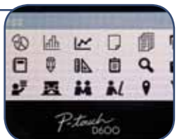
14 fonts ; 99 frames Over 600 symbols