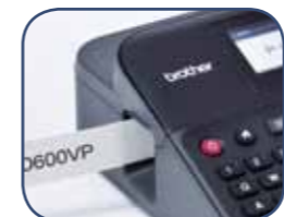
Automatic label cutter