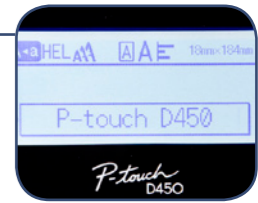
Graphic display with print preview