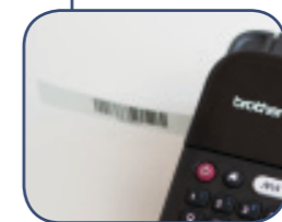
Built-in barcode printing