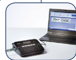
Prints labels from your PC or Mac