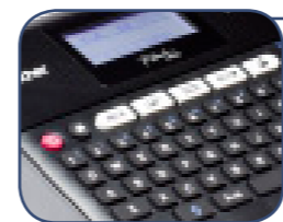
Easy-to-type PC-style keyboard