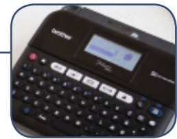
Built-in editable label designs