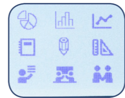
14 fonts ; 99 frames Over 600 symbols