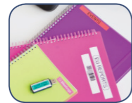
Print labels 3.5 – 18mm in width

This high specification labeller is the ideal partner in your office to help you and your colleagues stay organised, though the clear identification of important items using durable P-touch labels.