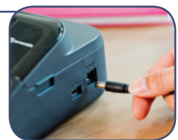
Uses 6 x AA batteries* or included AC adapter