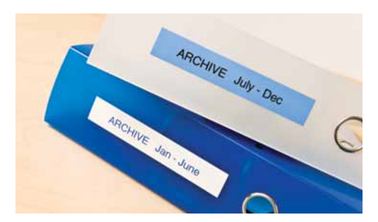
Identify all your important paperwork with clear labelling of file folders

Brother TZ tape cassettes are available in a large variety of widths and colours, so you're sure to find one suitable for your needs, whatever the labelling application.