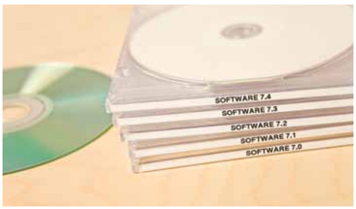
With a wide variety of label widths and colours available, there is a tape for all your applications