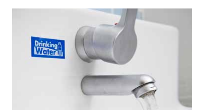
The 55 Label Collection designs include commonly used signage

The P-touch 2030VP has 55 pre-set graphic labels built-in. With just a few key presses you can quickly view each of these labels on the graphic LCD display, choose the one required and then print. The entire process takes just seconds to complete. Already translated into 18 languages, each label can be printed in a language other than your usual one, if and when required.