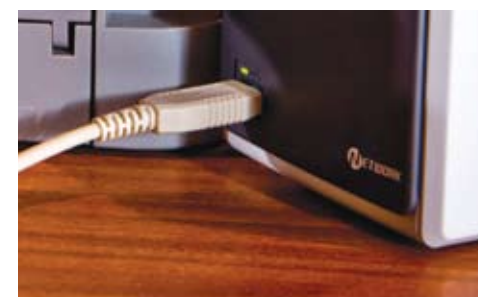
Disconnect the PC and connect the barcode scanner