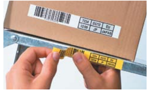
P-touch Editor 5 label design software supports many different barcode protocols

Developed for professional use in either the office or industry, the P-touch 9700PC prints labels for any application. Externally, the machine has both USB and RS-232C serial ports, for quick and easy connection to a PC or Mac.* Inside you will find a high resolution print head that, when used in conjunction with HG tapes, offers a print resolution of up to 720 x 360dpi, and a print speed of up to 80mm/second. Perfect for where many labels are required quickly, such as in manufacturing, event management, filing systems and asset management.