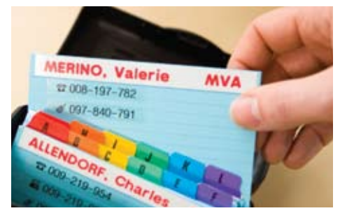
Find important information quickly through clear and precise labelling