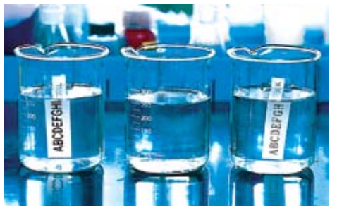
Water and chemical resistant: glass plates with laminated labels attached were immersed in water and various chemicals for two hours. The text was unaffected