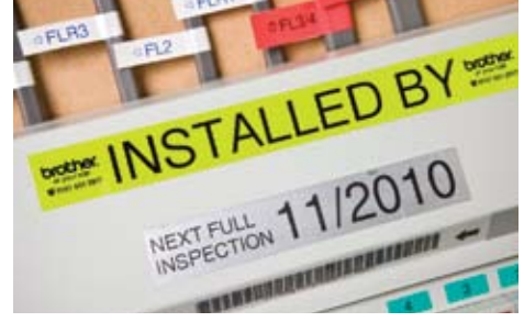
TZ tapes are available in a wide range of colours and sizes