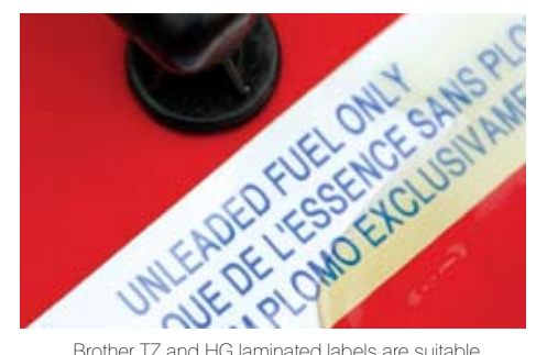
Brother TZ and HG laminated labels are suitable for the most demanding of applications