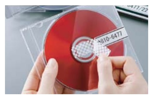
Security tape: a special tamper evident tape that cannot be re-applied once removed