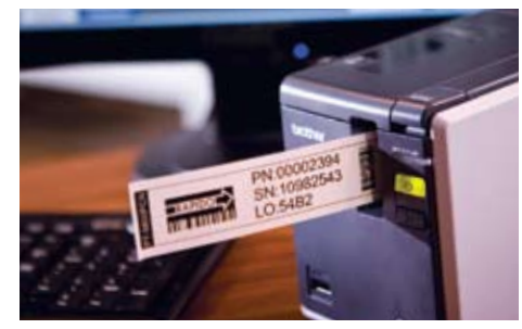
Microsoft Excel data can be merged with the label layout to print labels containing variable data