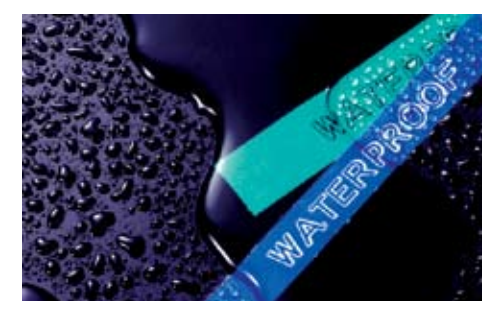
P-touch laminated labels are designed to withstand extreme conditions