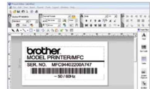
P-touch Editor 5 gives full control of label design which can include text, barcodes and images