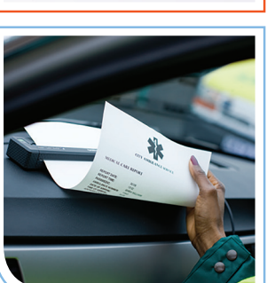
Durable , and dependable. The PJ-700 series has been designed for reliable printing in many environments

Choice of power options including Li-ion rechargeable battery, AC adapters or vehicle power kits