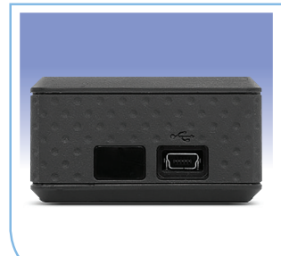
Direct thermal printing offers the most reliable technology for mobile printing solutions