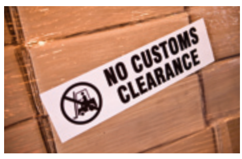
The continuous roll offers the ability to create temporary signage on demand