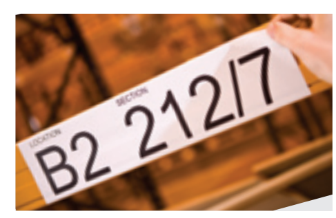
Create temporary warehouse racking identification labels as and when required