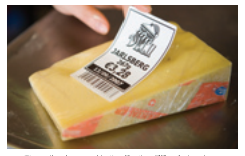
The adhesive used in the Brother RD rolls has been certified safe for food labelling