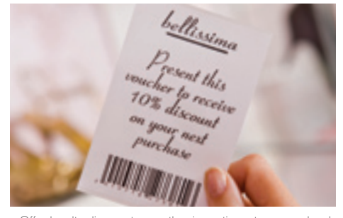
Offer loyalty discounts, or other incentives, to your valued customers with specially printed vouchers