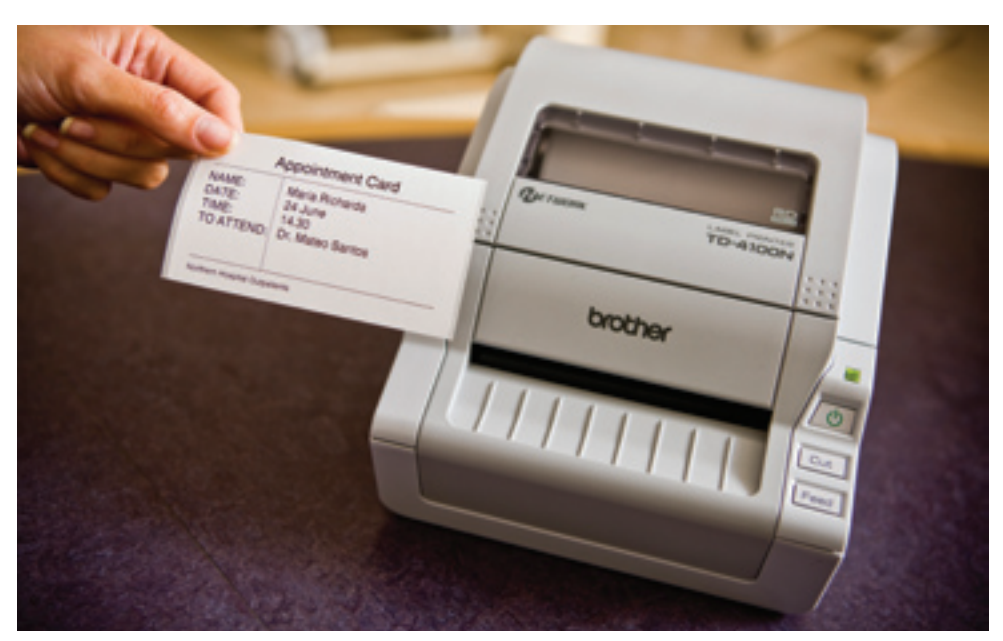
By connecting the TD-4100N to a nearby network point, the machine can be sited wherever the labels are required

The professional and reliable method of connecting label printers is typically via a network, and the TD-4100N incorporates a 10/100 Base TX network port as standard. By giving the opportunity to locate the label printer away from the PC, you have the advantage of being able to place the label printer wherever your labels are required. And of course, networking offers the ability for any number of users or computers to print their labels to the same label printer. If many copies of labels are required quickly, the "distributed printing" function (found in the printer driver) will automatically send the print job to two or more connected printers - thereby increasing throughput. As an example, if two TD-4100N label printers are set up for distributed printing and 10 copies of a label are required, the driver will automatically send five labels to one printer, and five labels to another.