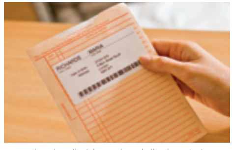
Locate patients' records and other important documentation quickly with an identification label