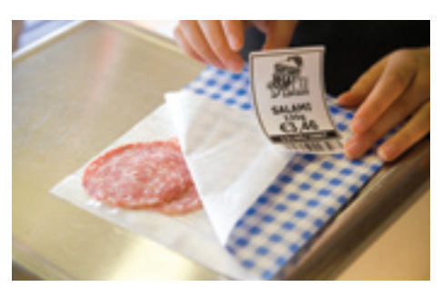
Ensure your customers have all the product and ingredient information required

Easy to read labels are essential to consumers, to help make informed decisions prior to a potential purchase. The 300dpi print resolution and high quality RD label rolls used in the TD-4000 and TD-4100N ensures that every label printed looks professional, offering sharp text, logos and barcodes with a high contrast to ensure faultless scanning at the checkout.