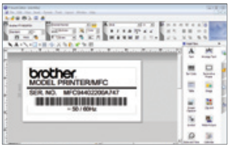
P-touch Editor 5 gives you the creative options to design and print any label required

Connect to non-windows devices using the RS-232 serial port. By sending simple text commands containing the label format and the text/barcode to be printed, the labelling machine will print the label required. No driver or software needs installing.