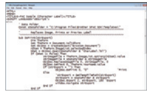
Use the b-PAC SDK to add label printing directly within your own Windows™ applications