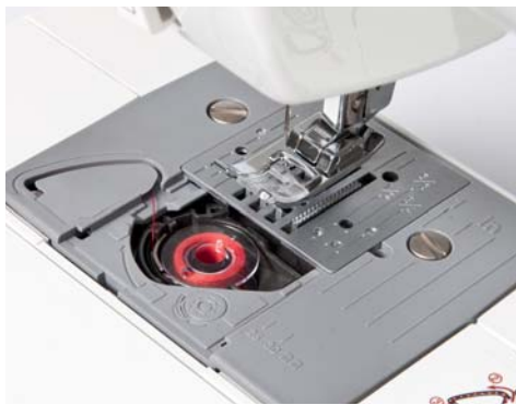
Quick set bobbin – just drop in a full bobbin and you are ready to sew