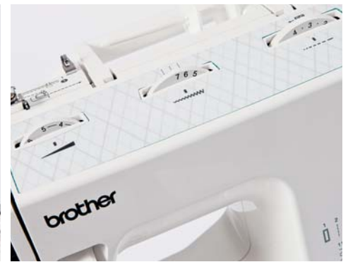
Stitch length and width adjustment

For more informations see your dealer or visit www.brothersewing.eu .