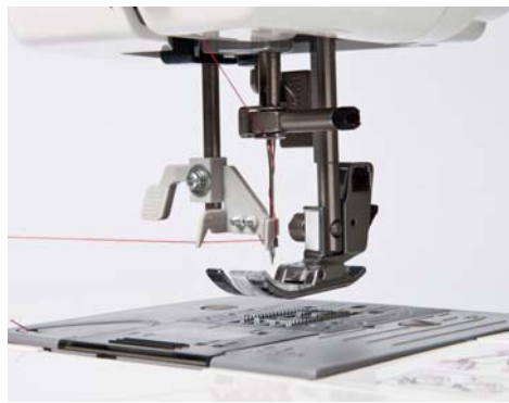
Easy automatic needle threading