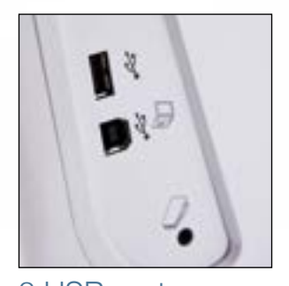
2 USB ports

Free up your hands using this knee lift to raise/lower the presser foot. Ideal when working on larger projects such as quilts.