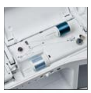
Independent bobbin winder

Adjust the speed from slow to fast. This can also be set to alter stitch width whilst sewing.