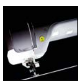
Ultra-bright feature lighting

The ultra-bright LED lighting gives a crisp, bright natural light, so you can see colours and stitch details, no matter what your lighting conditions. The lighting brightness is fully adjustable, so you can set it at a level to suit you and your environment.