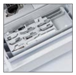
Handy accessory compartment

Includes multi-directional feed to sew straight in eight directions and in four directions with zig zag.