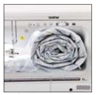
11<sup>1</sup>/4" extra-large sewing space

Create even larger projects with the flexible extra-large sewing space, ideal for quilting projects.