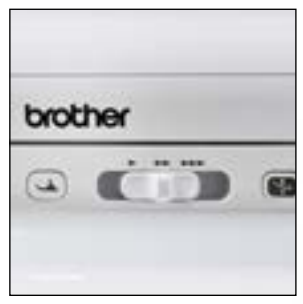
Slide speed control

Create even larger projects with the flexible extra-large sewing space, ideal for quilting projects.