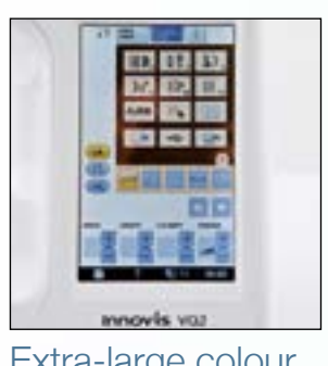
Extra-large colour touchscreen

Wind a new bobbin while you continue to sew. Enjoy fingertip control of the bobbin winding speed to suit different thread types. Use the spool pin for twin-needle sewing.