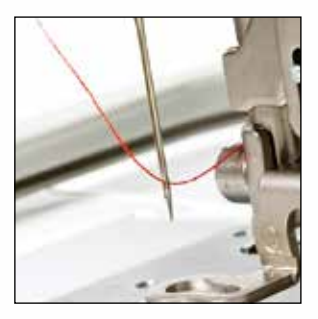
Automatic needle threading

Super bright full spectrum natural lighting system. Adjustable in the touch screen display.