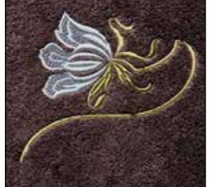
17 built-in fonts and 224 embroidery designs