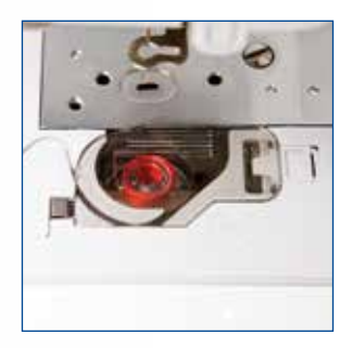
Quick-set drop-in bobbin

Simply drop in a full bobbin and direct the thread through the guide and you are ready to go.