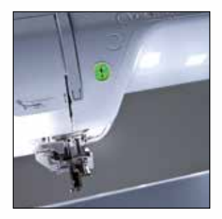
Full spectrum LED lighting

Super bright full spectrum natural lighting system. Adjustable in the touch screen display.