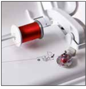
Independent bobbin winding

Simply drop in a full bobbin and direct the thread through the guide and you are ready to go.