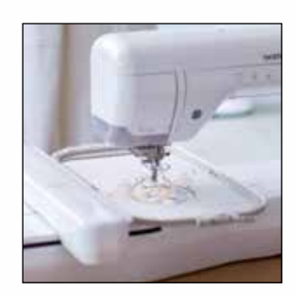
Large embroidery area

Simply connect to your PC via the USB port, or insert a USB memory stick, to quickly and simply import or export designs.