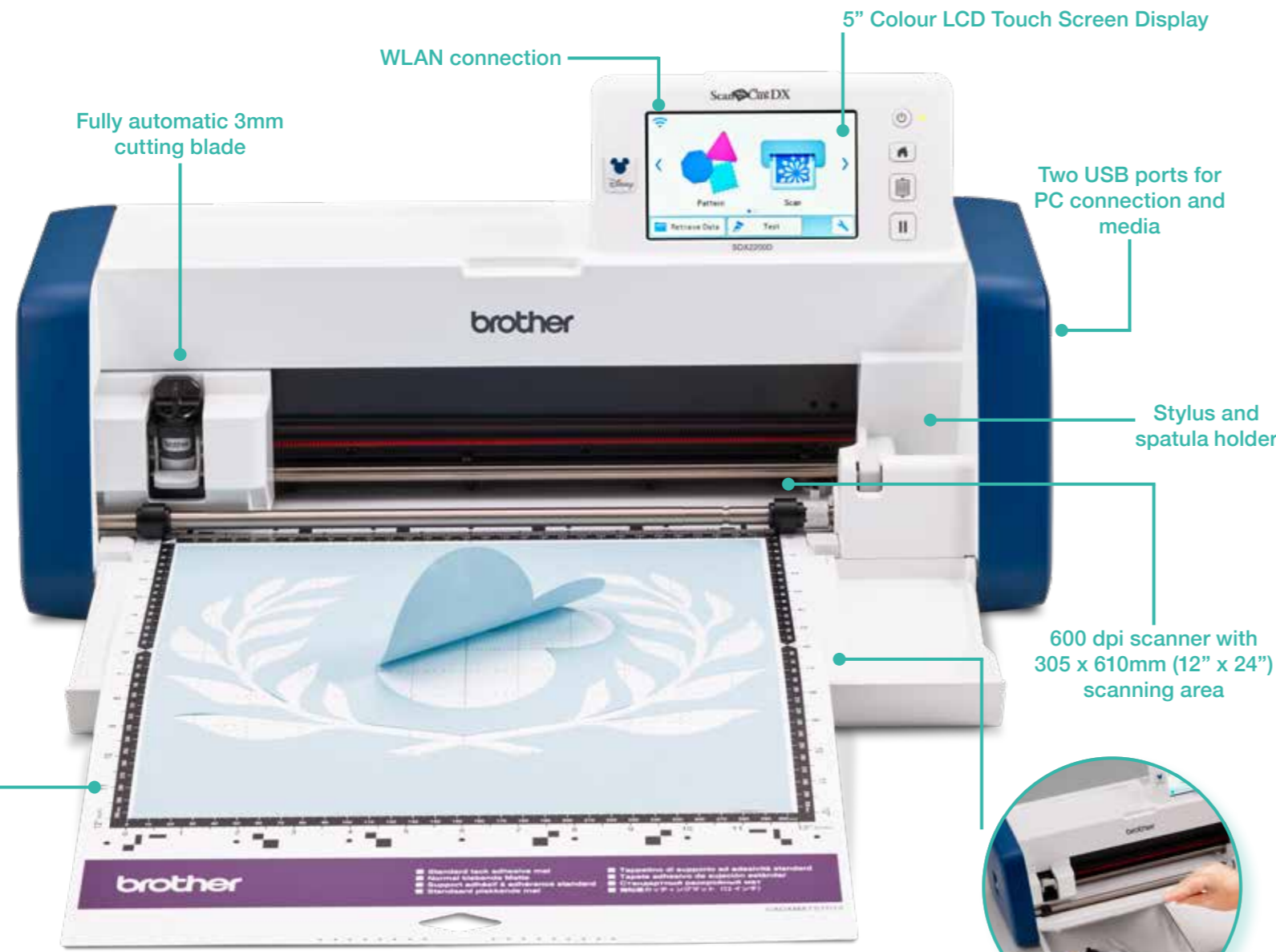
Accommodates 305 x 305mm (12" x 12") and 305 x 610mm (12" x 24") cutting mats

Add a seam allowance in quarter inch increments for easy pattern piecing.