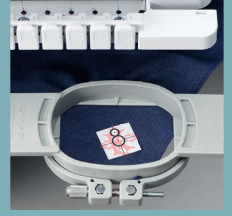
Camera positioning sensor

Scan projects in the hoop and display them on the large screen, so you can easily position the design before you start to embroider. Ideal for positioning patterns on necklines or complex quilt squares. Patterns can be re-sized, edited and the angle adjusted as required to suit the garment or project.