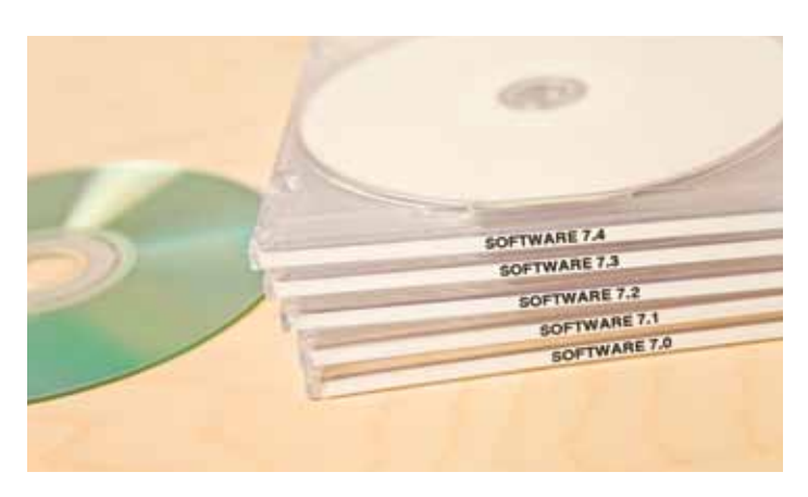
With a wide variety of label widths and colours available, there is a tape for all your applications

Choose any of the 31 auto formats for easy labelling of file folders, CD/DVD cases etc.