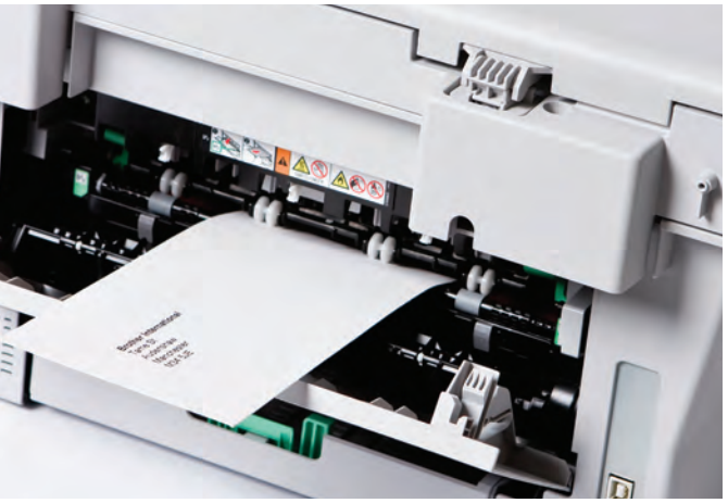
Print on thicker media and envelopes using the manual feed slot

The DCP-7055 comes complete with a range of easy-to-use software utilities to improve your productivity. Bundled with the powerful Scansoft<sup>®</sup> Paperport<sup>™</sup> document management software, hard copy documents such as invoices can be scanned in colour, stored and managed electronically for future retrieval.