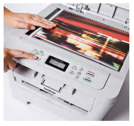
Scan colour documents direct to your PC