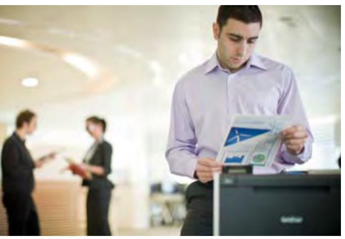
Ideal for busy offices: share resources via your existing network

SSL encryption. Although documents are sent from computer to printer within seconds, this is long enough for the information to be hacked. SSL prevents this by encrypting the data you send over the network.