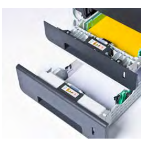
Add a second tray for more convenient paper handling.