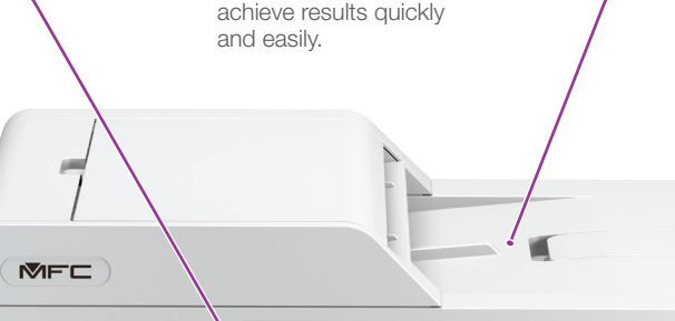
. . .

including Push scanning, scan to network (Windows® only) and scan to FTP allows information to be shared quickly.