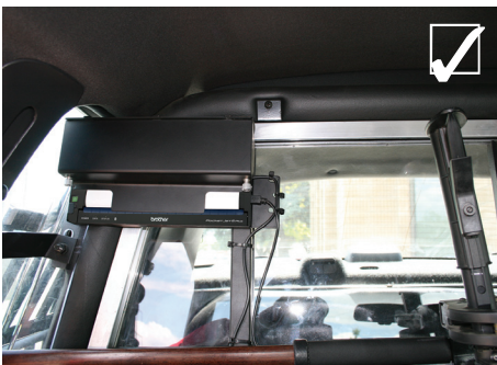
Brother PJ600 thermal A4 printer using vehicle mount