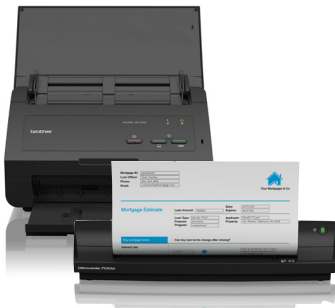
ADS-2100 and DS-700D