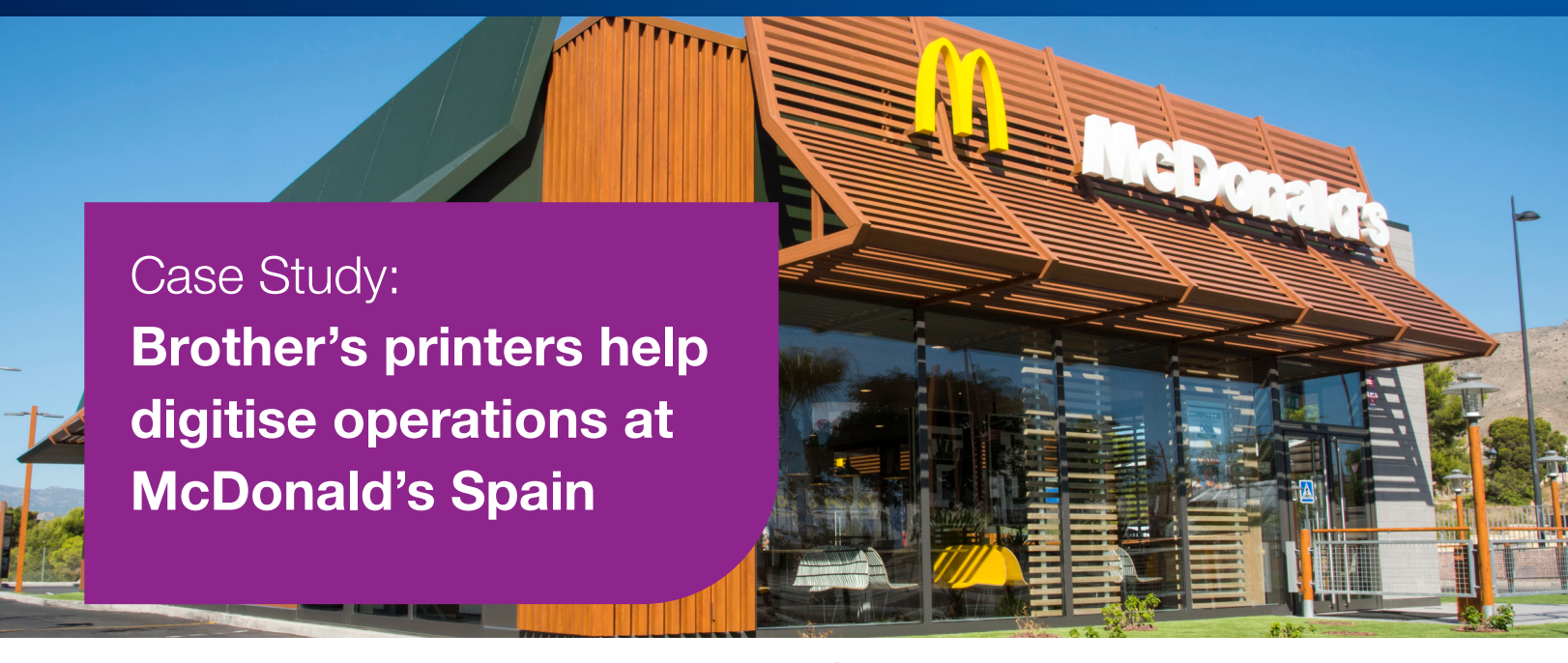
Food Labelling Solutions