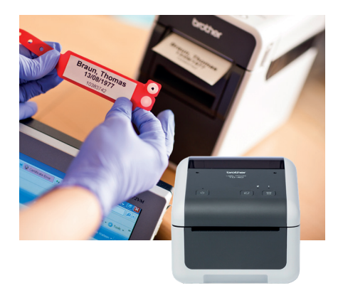
With PA-TDU- 001 touch display unit, PA-BB-001 battery base and PA-BT-4000LI Li-ion battery

And with optional long-life battery, it empowers clinicians to provide care on location, where it is needed.