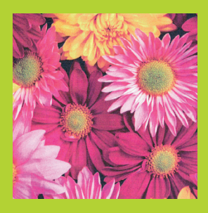
Sample print using Brother Genuine Supplies as tested by Buyers Lab

The right colour match and consistent colour production is vital – especially when it comes to things like company logos. Brother Genuine Supplies deliver a brilliant colour range and consistent colour quality from first page to last<sup>2</sup>. The non-genuine brands in Buyers Lab's tests, however, showed a small colour range and large colour variance, resulting in greater inconsistency in colour production<sup>2</sup>.