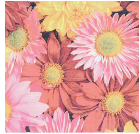
Sample prints using third-party toners as tested by Buyers Lab -highlighting the colour variance.