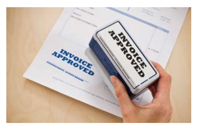
The stamp handle has been designed for maximum grip and comfort in the hand

Stamps are available in a wide range of size and colour combinations