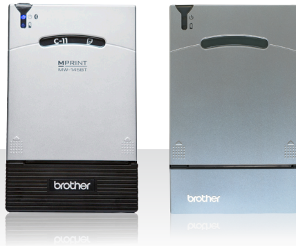
MW-140BT / MW-145BT

For further information please visit our website