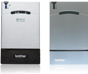
MW-140BT / MW-145BT