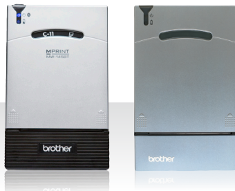
MW-140BT / MW-145BT