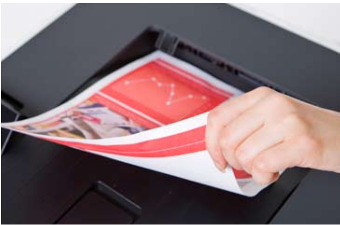
High-resolution printing for professional results.

Safe and secure Be safe. Print your most confidential documents, safe in the knowledge that they will remain just that, with Brother's Secure Print feature. It's incredibly easy to use: when you're ready to print your document, you enter a private PIN code on your computer, then click the print button. The document will print only after you've physically entered your PIN code at the printer. SSL encryption. Although documents are sent from