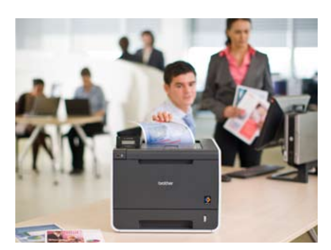
The ideal networked device for your busy office.