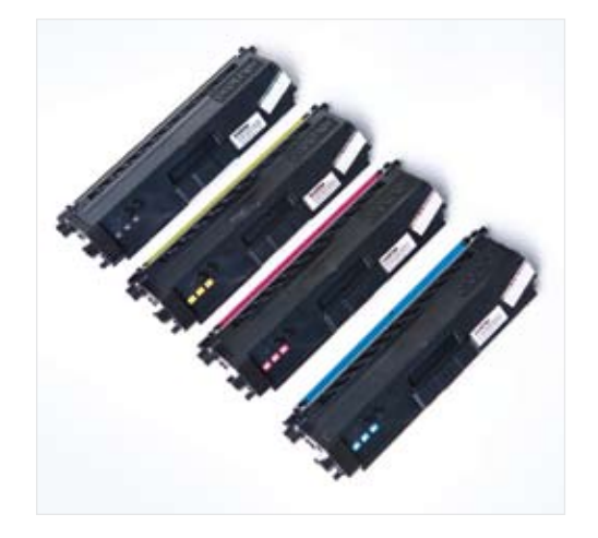
Choice of standard, high- and superhigh-yield cartridges to perfectly suit your print volume.

You can get more done in the office with the HL-4570CDW's innovative, simple to use solutions that save you time and money.